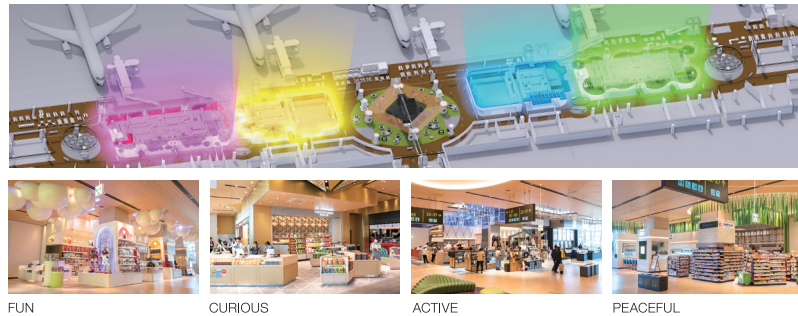
FUN CURIOUS ACTIVE PEACEFUL